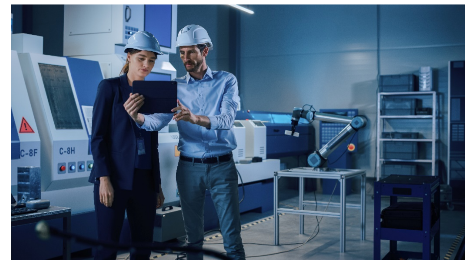
Individuals pictured above are actors, students and/or employees of Western Tech