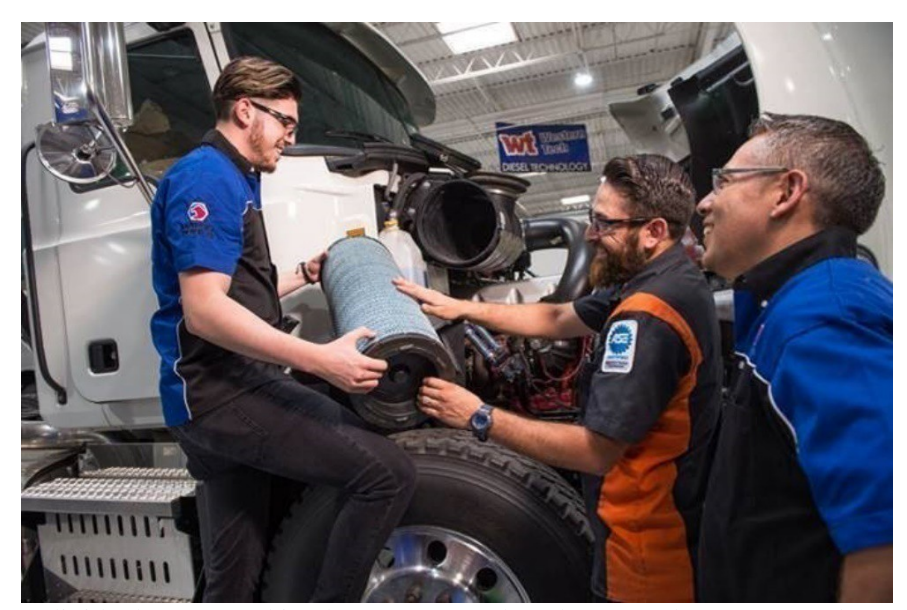
Individuals portrayed in photos are actual students, graduates, or employees of WTC.