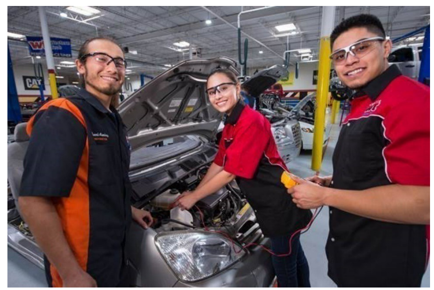
Individuals portrayed in photos are actual students, graduates, or employees of WTC