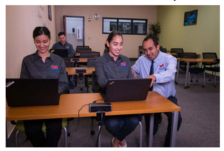
Individuals pictured above are actors, students and/or employees of WTC

Available at 9451 Diana Drive Campus & 9624 Plaza Circle Campus This program is offered 100% online at the Diana Dr. Campus and 50% online at the Plaza Circle Campus