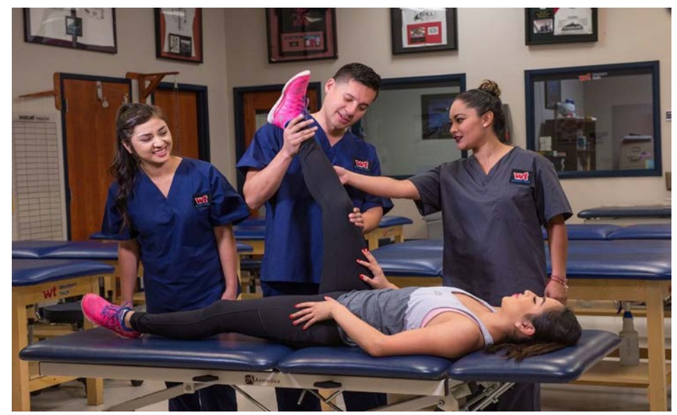
Individuals portrayed in photos are actual students, graduates, or employees of WTC.