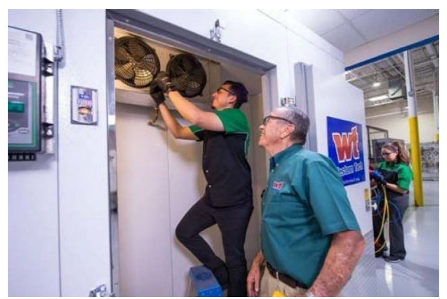
Individuals portrayed in photos are actual students, graduates, or employees of WTC.