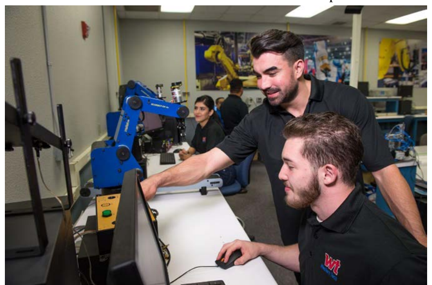
Individuals portrayed in photos are actual students, graduates, or employees of WTC.