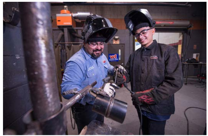
Individuals portrayed in photos are actual students, graduates, or employees of WTC