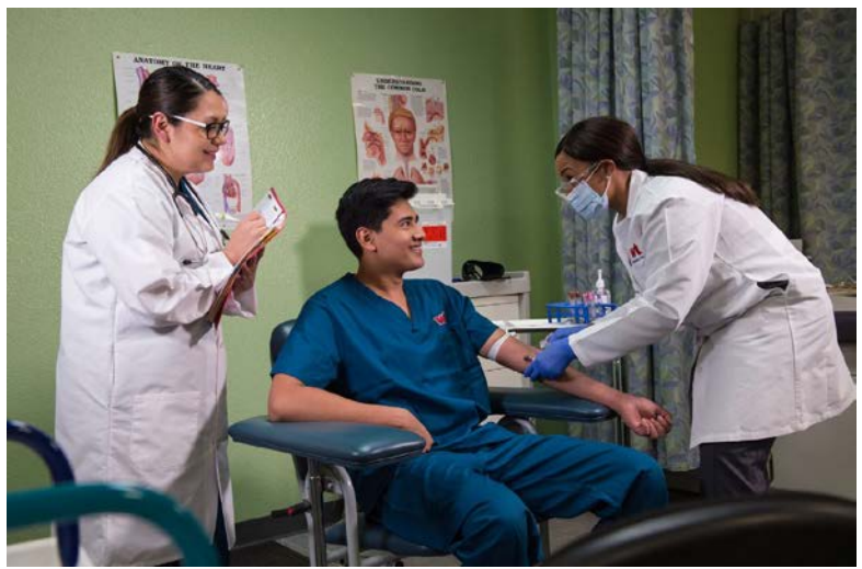
Individuals portrayed in photos are actual students, graduates, or employees of WTC.