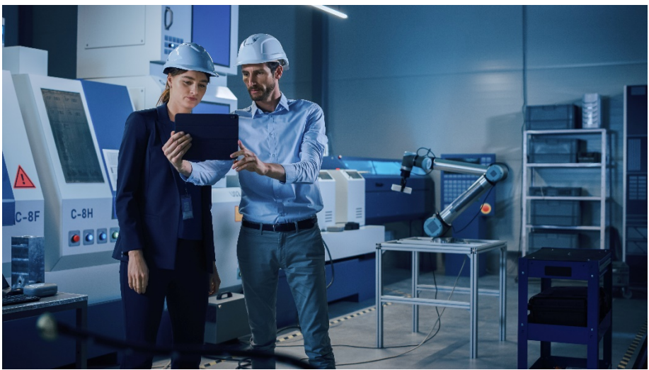
Individuals pictured above are actors, students and/or employees of Western Tech