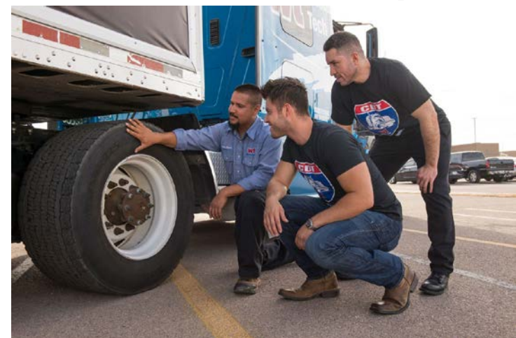
Individuals portrayed in photos are actual students, graduates, or employees of WTC