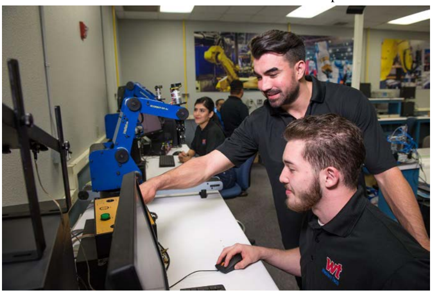
Individuals portrayed in photos are actual students, graduates, or employees of WTC.