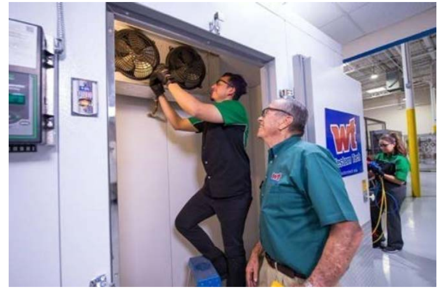
Individuals portrayed in photos are actual students, graduates, or employees of WTC.