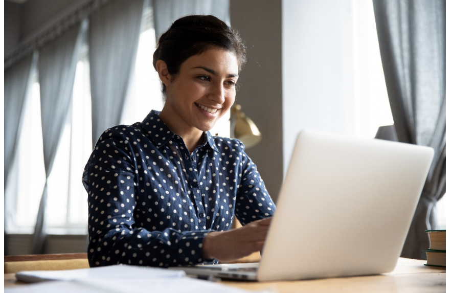
Individuals pictured above are actors, students and/or employees of WTC