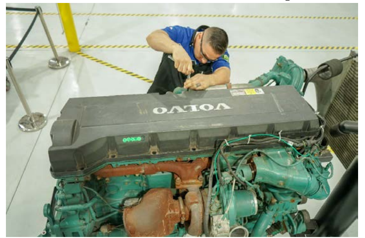
Individual portrayed in photos are actual students, graduates, or employees of WTC.