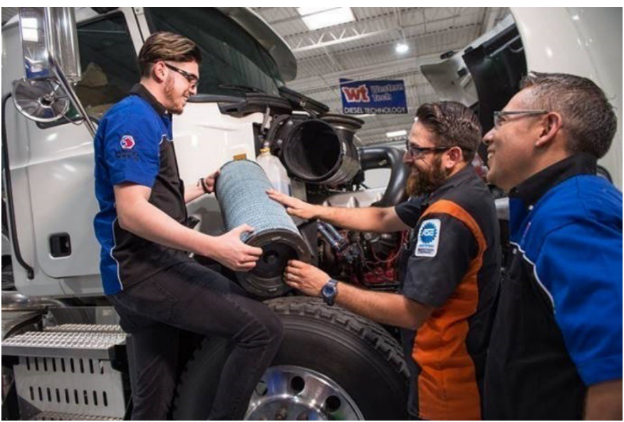
Individuals portrayed in photos are actual students, graduates, or employees of WTC.