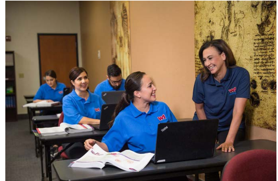
CERTIFICATE OF COMPLETION IN MEDICAL BILLING AND CODING Offered 100% online